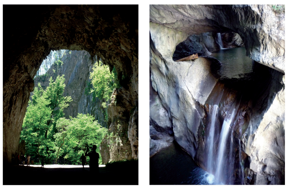
Fig. 3. Škocjan Cave (Slovenia): to the left – entrance to the cavern, to the right – underground waterfalls

As it was indicated in the Table 1, the following regularity is observed in distribution of UNESCO karst properties by the parts of the world: in Asia - 16 sites with a total area protected of 7241 km<sup>2</sup> (7 241 009 ha), in North America – respectively 8 and 3950 km<sup>2</sup> (3 950 054 ha), in Europe – 7 and 191 (191 335), in Australia - 4 and 3882 (3 881 635) and in Africa – 2 and 1870 km<sup>2</sup> (1 870 000).