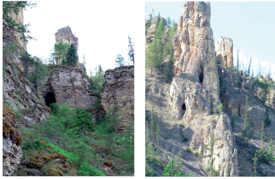
Fig. 4. Caves of the Sinyaya River Valley: to the left – in the locality Peschanka, to the right – near a mouth of the River Silbakh

A remarkable example of a naked sulphate karst is developed in SE part of the Belomorsko-Kuloy Plateau located on the NW of the Russian Plain at 70-180 m above sea level. Lower Permian gypsums and anhydrites with a typical thickness 40-70 m are exposed here. The rocks have practically a monomineral composition: 95-98% consisting of CaSO4 x 2H2O (The Karst... 2011).