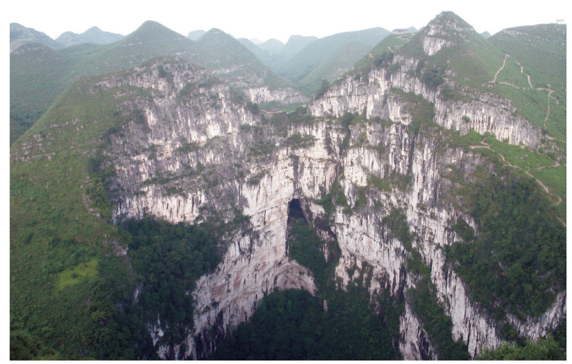
Fig. 2. Karsthole of Leye, Guangxi, South China Karst (5)