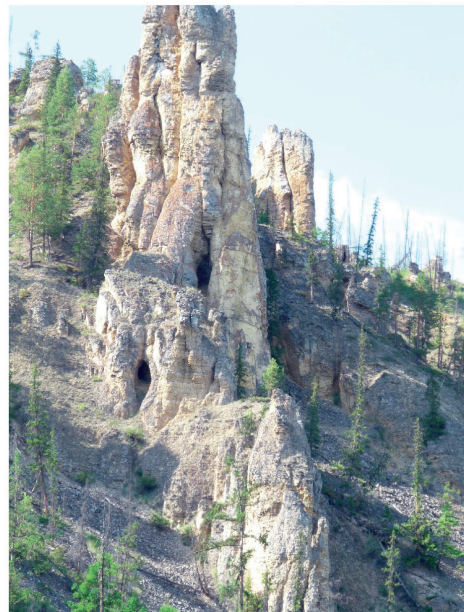
Fig. 4. Caves of the Sinyaya River Valley: to the left – in the locality Peschanka, to the right – near a mouth of the River Silbakh