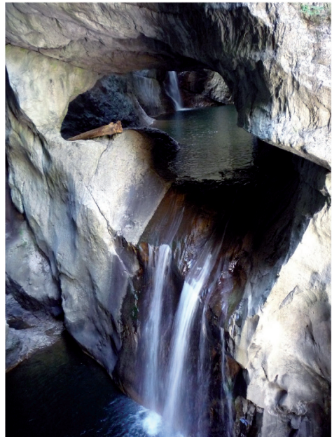
Fig. 3. Škocjan Cave (Slovenia): to the left – entrance to the cavern, to the right – underground waterfalls