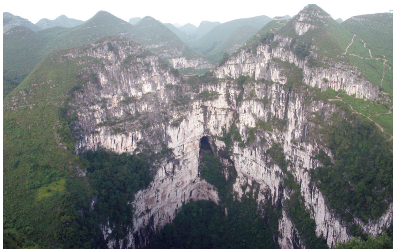
Fig. 2. Karsthole of Leye, Guangxi, South China Karst (5)