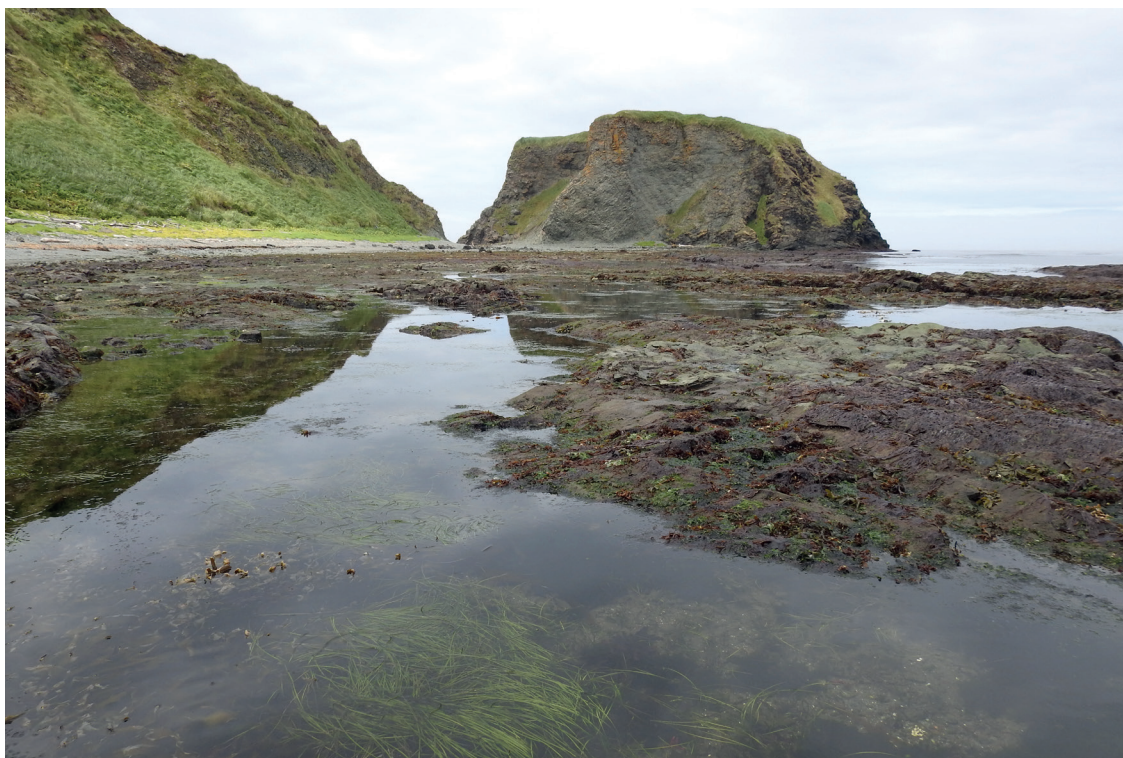
Fig. 2. Typical aggregation of Phyllospadix iwatensis, the northern coast of Urup Island. 2.09.2019.

Since the seagrasses were not properly investigated in the past in the area under consideration, we do not know for sure whether the Phyllospadix iwatensis or Zostera asiatica lived there «initially», or they have recently increased in numbers and expanded the range due to climatic changes. Anyway, the surveyed islands turned out to be a «reserve» for vulnerable species of seagrasses, at least for Phyllospadix iwatensis . The lack of suitable substrates is believed to be the reason for the limited distribution