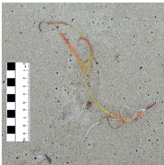
Fig. 1. Beached fragment of Zostera marina , Sambia peninsula