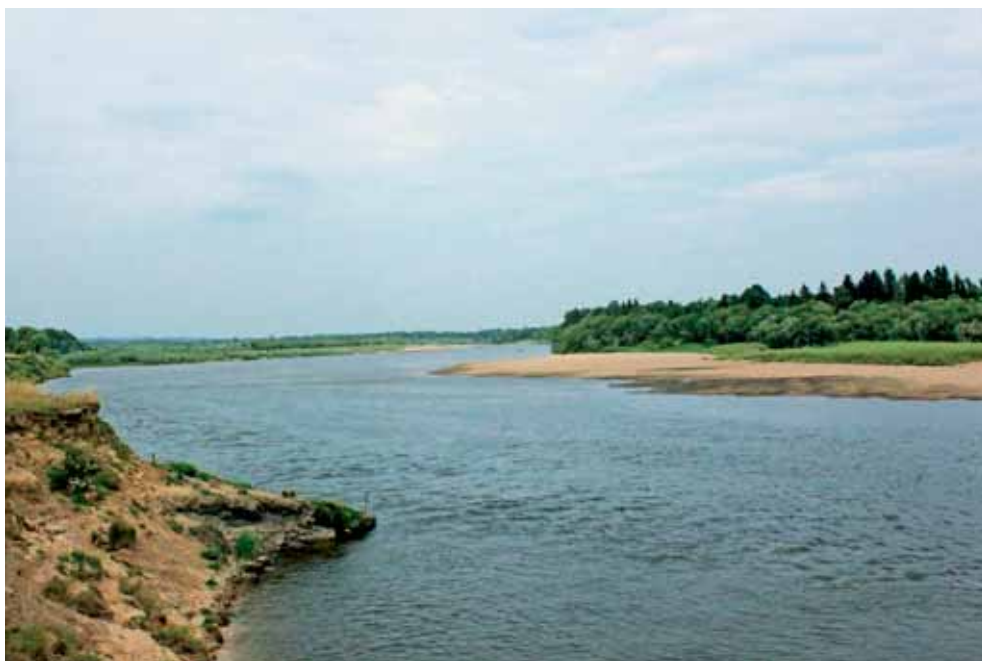
Fig. 1. Unzha river near Medvedevo village – about 50 km downstream from Manturovo

damage for the majority of pollutants is even smaller (about 800 m 2 ), but they go straight into the river as the wastewater treatment plant is located on its banks.