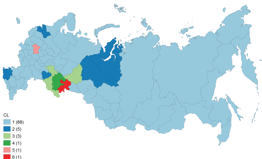
Fig. 1. Clustering of the social ties of the Republic of Bashkortostan

E.G. Ravenstein postulated the importance of the first order regions in migration, and now it is a well-known law in regional studies, however widely available means of communication may distort the pattern at different regional scales. That is why it must be tested firstly. As we poses data on the level of Russian regions, we can infer some conclusions at this level, however further work at the community, country and international levels is required in the future. For now, we have found empirical evidence of the importance of the first order neighboring regions in social communication. Chelyabinsk oblast is truly a sister region of the Republic of Bashkortostan. In fact, the Bashkir Far Ural («Zaural'e») territories and towns (Sibay, Uchaly, Baimak and Beloretsk) tend to cooperate with developed