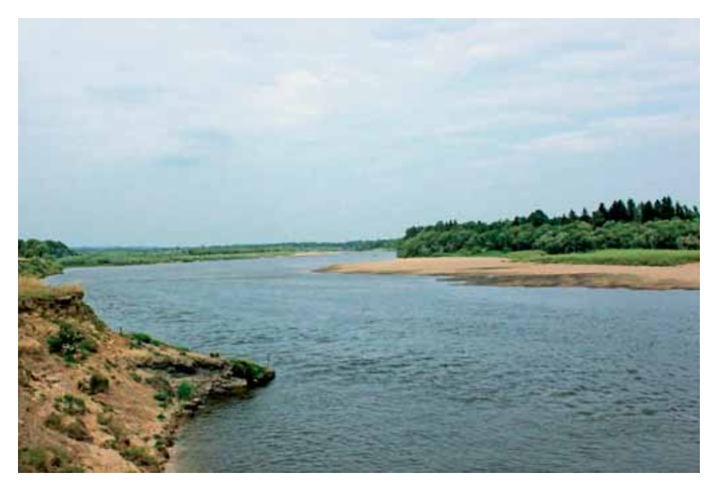
Fig. 1. Unzha river near Medvedevo village – about 50 km downstream from Manturovo (photo by Gunko M.)

damage for the majority of pollutants is even smaller (about 800 m<sup>2</sup>), but they go straight into the river as the wastewater treatment plant is located on its banks.